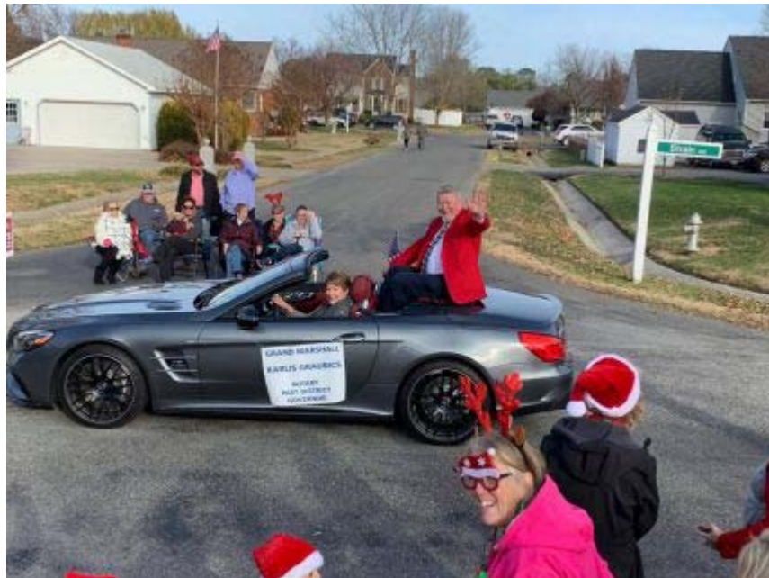
South Hill Parade's Float