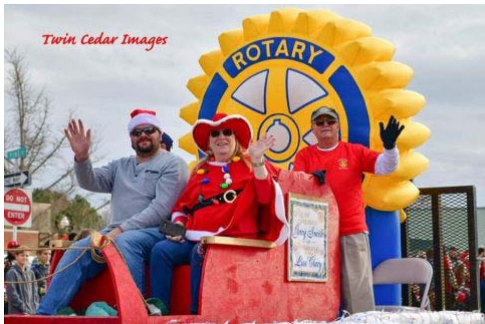
Williamsburg Area Rotarians from the Rotary Clubs of James City County, JCC Satellite, The Historic Triangle, and Williamsburg joined together to walk in the 54th annual Williamsburg Christmas parade.