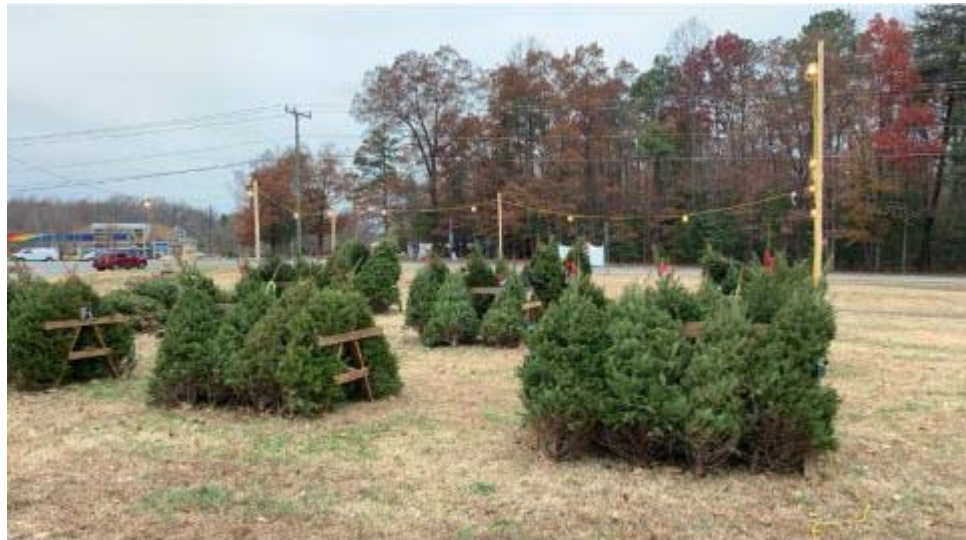
Club members and some young men from the New Kent Beta club donated their time helping to sell and load Christmas trees. The efforts were coordinated by the New Kent Rotary Club with the proceeds going to the Sheriff's Auxiliary in New Kent.